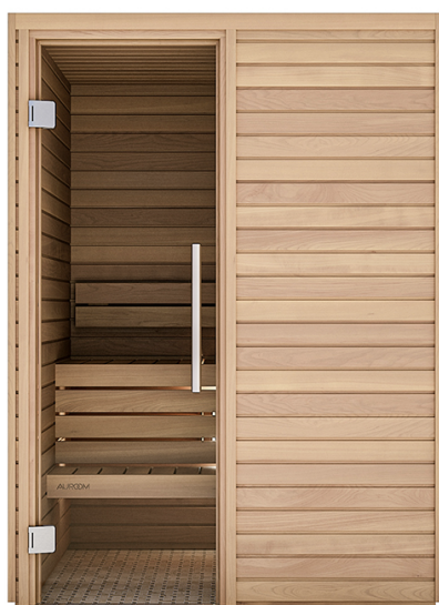
Model 120x150 cm